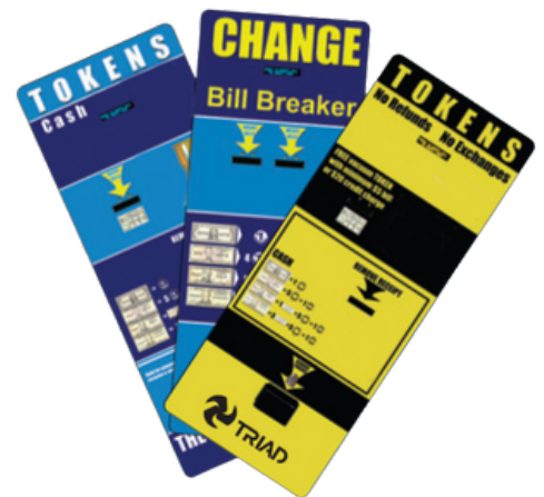
Custom decals available!